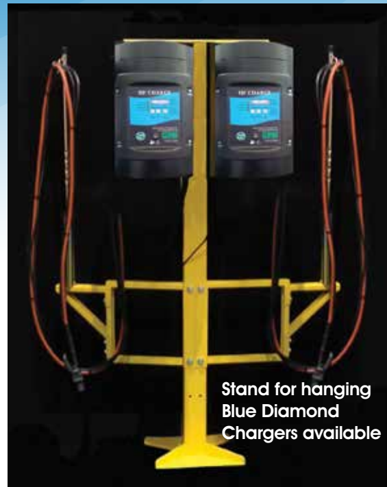
Stand for hanging Blue Diamond Chargers available

4646 Technology Drive Salem, VA 24153 P: 877-914-8999 F: 540-982-4287